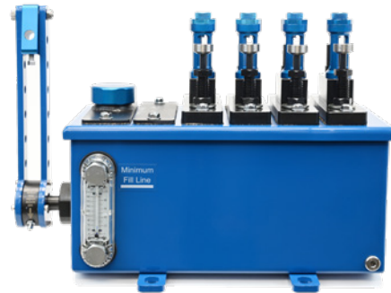
4 feed ratchet driven pump to point system