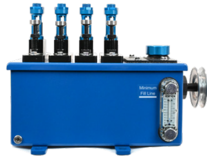
4 feed belt driven pump to point system