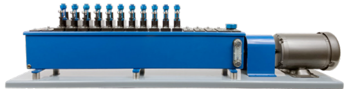
10 feed pump to point system with horizontal electric drive, high/low level switch, and level control

Not every application requires a full-featured lubrication system, and not every budget can afford one. Sloan Lubrication Systems designs custom pump to point lubrication systems for the price-constrained operation with a less critical application.