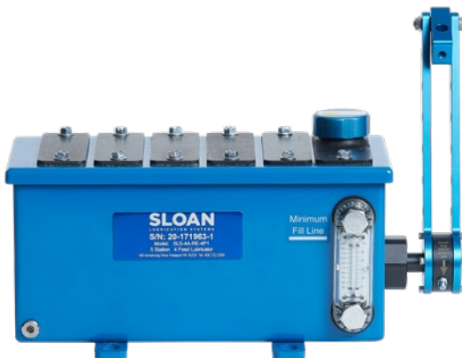
SLS-4A-RE - ratchet driven lubricator