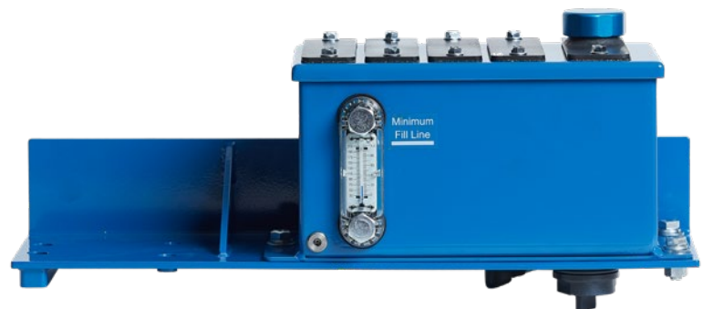
SLS-4J-RB-Ajax with right bottom input shaft and custom mounting for an Ajax

SINCE 1922, AND NOW FOUR GENERATIONS OF FAMILY, SLOAN LUBRICATION SYSTEMS HAS BEEN THE LUBRICATION SOLUTION FOR RECIPROCATING AND ROTARY EQUIPMENT. WE INSPECT, INSTALL, TEST, TRAIN, AND MAINTAIN YOUR COMPONENTS TO ENSURE OPTIMAL PERFORMANCE FOR YEARS TO COME.