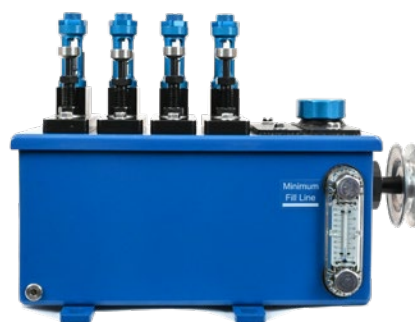
4 feed belt driven pump to point system