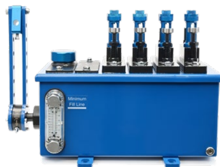
4 feed ratchet driven pump to point system